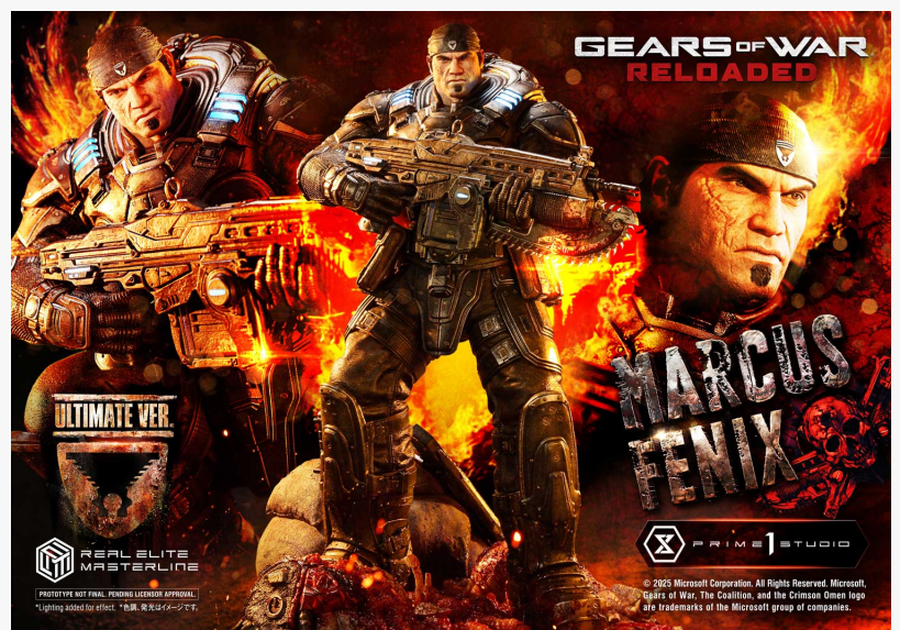
Real Elite Masterline Gears of War: Reloaded Marcus Fenix

A standing lower body is included as well, presenting Marcus with two feet planted firmly on the ground and bringing the overall display to nearly 1 meter in height.