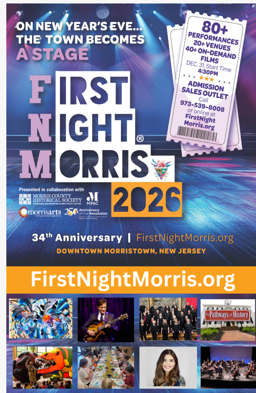
First Night Morris County 2026 Poster, December 31, 2025

Macculloch Hall Historical Museum will also anchor the evening’s historical offerings, welcoming visitors to explore