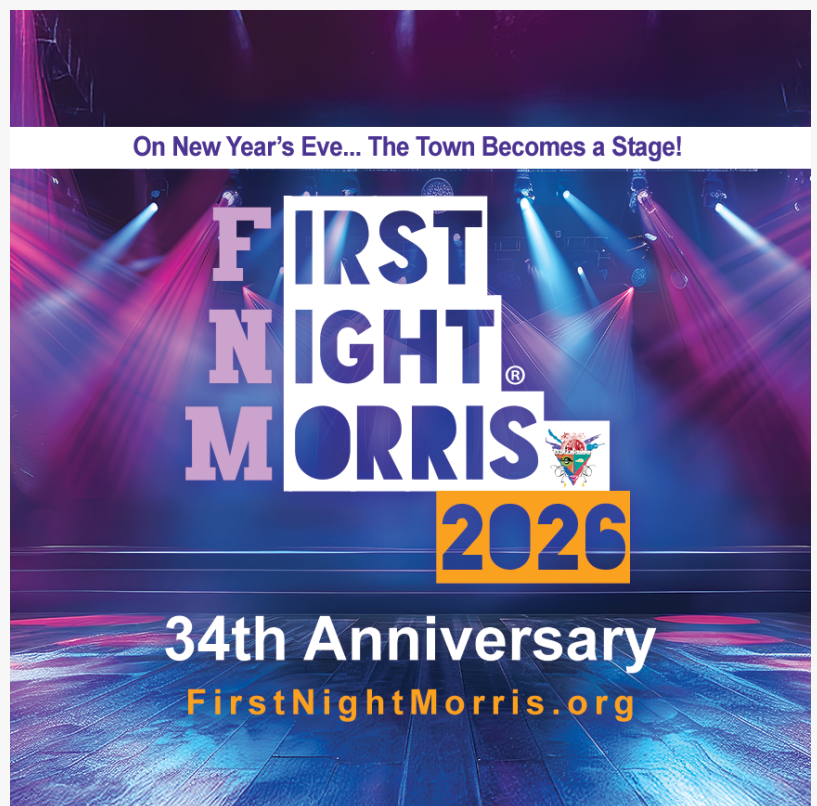
First Night Morris County 2026, December 31, 2025 Event Button