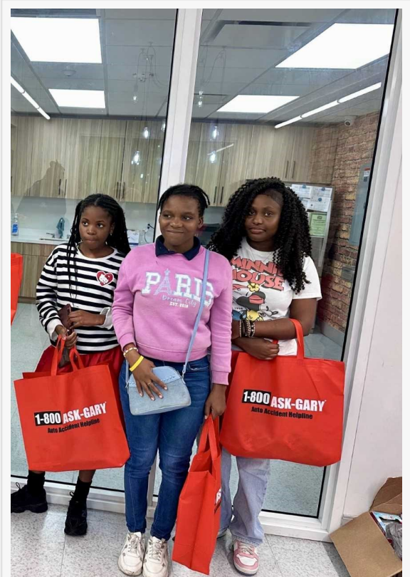
Teens at the Boys and Girls Club of Broward County

“As we celebrate 60 years of service, providing a world class club experience, partnerships such