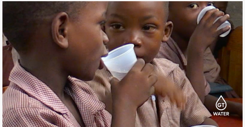
School Children Drinking Clean Water in Haiti

RAMSEY, NJ, UNITED STATES, December 22, 2025 /EINPresswire.com/ -- Nonprofit organization GT Water announced that one million people in Haiti and Honduras now have access to clean drinking water through its bucket filtration systems, marking a major milestone in efforts to reduce waterborne disease in the region.