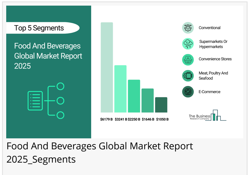
Food And Beverages Global Market Report 2025_Segments

Asia Pacific will be the largest region in the food and beverages market in 2029, valued at $3,293 million. The market is expected to grow from $2,520 million in 2024 at a compound annual growth rate (CAGR) of 5%. The strong growth can be attributed to the increasing health consciousness and e-commerce and online food delivery.