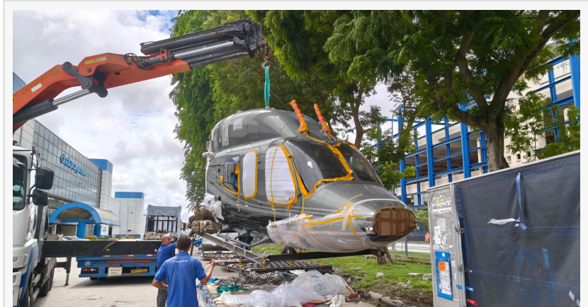
B&H Worldwide Loading Bell 429 Helicopter

has further expanded its rotary-wing logistics capabilities with the successful handling of a Bell 429 helicopter movement from India to Singapore, supporting the aircraft's return to Bell Textron's regional hub for maintenance and inspection.