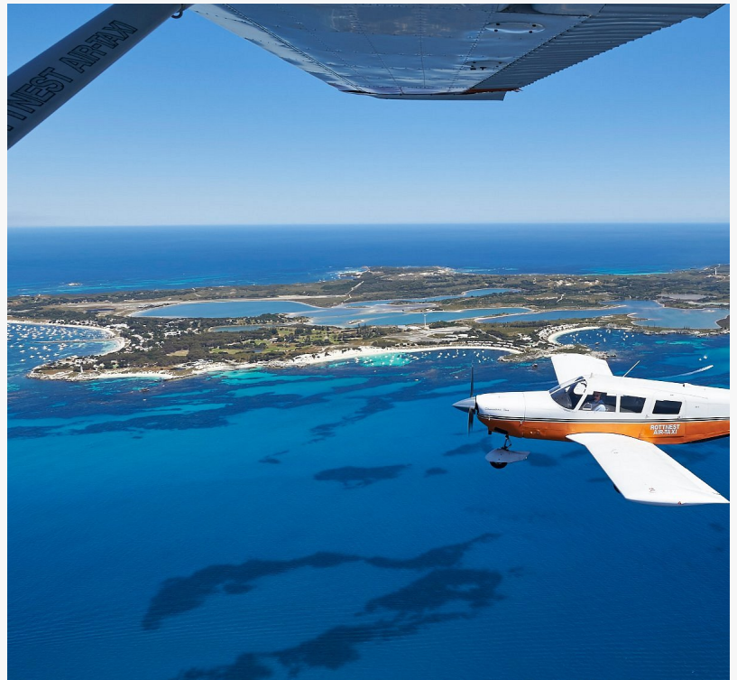
Rottnest Air Taxi flies to Rottnest island during all fair weather daylight hours

Flights between Perth and Rottnest Island take approximately 12 minutes, significantly reducing overall travel time when compared with sea transport once boarding and disembarkation are considered.