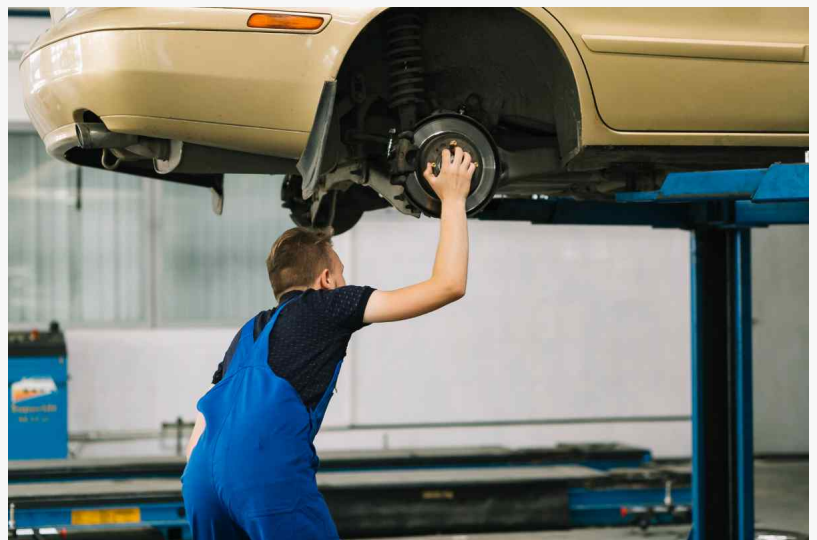
Preventative Vehicle Maintenance