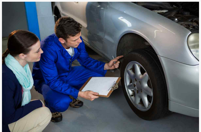
Vehicle Alignment Inspection

One such option is the "Tires + Alignment Bundle." This bundled service includes the installation of a set of four tires selected according to vehicle specifications, a professional wheel alignment service, and complimentary tire rotation for one year. Tire rotation is a routine