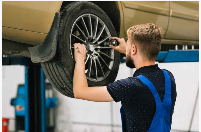
Free Wheel Alignment Check -