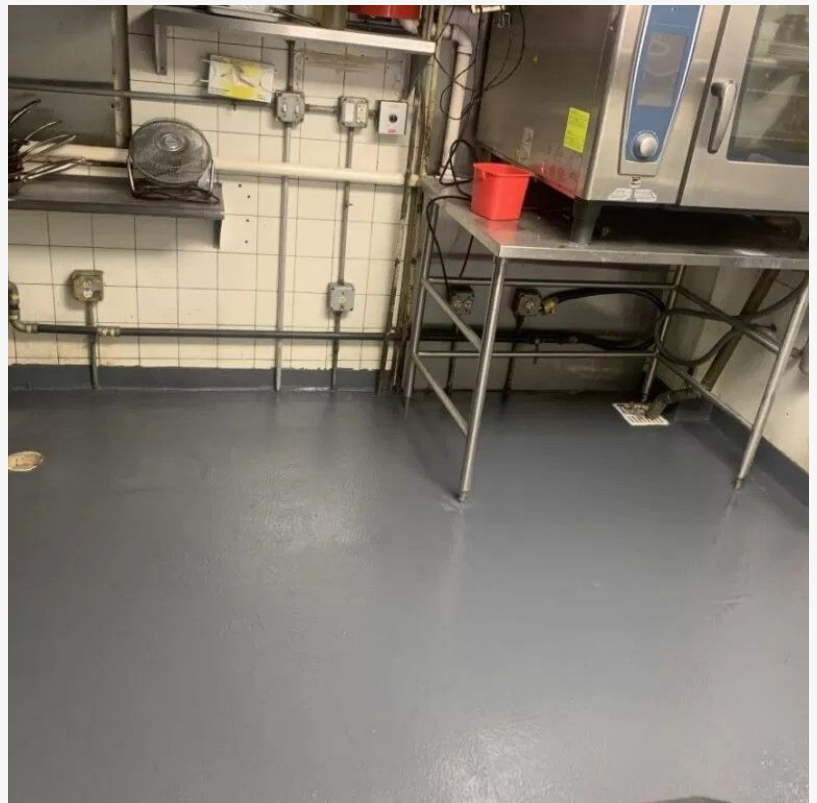
Restaurant Kitchen Flooring

MIDDLESEX, NJ, UNITED STATES, December 23, 2025 / EINPresswire.com/ -- High Performance Systems, a leading provider of industrial and commercial flooring solutions, has expanded its service offerings with state-of-the-art restaurant kitchen flooring systems that deliver unmatched durability, effortless maintenance, and enhanced safety for food-service operations. Built to withstand the unique demands of commercial kitchens, these flooring solutions are engineered to improve hygiene, resist chemical exposure, and minimize operational disruptions during installation.