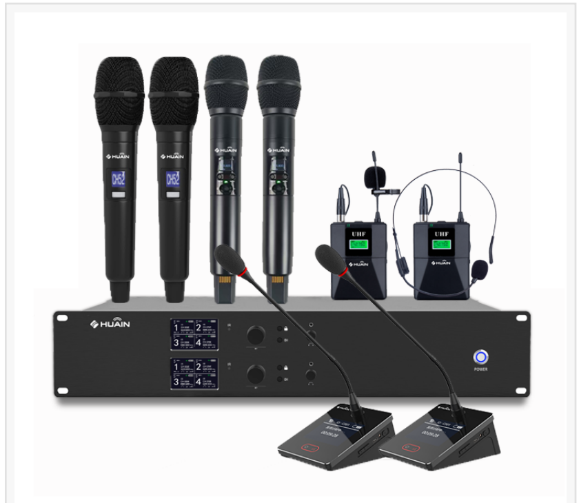
Best UHF Conference System Supplier from China

Meeting rooms and conference halls are no longer static. Organizations increasingly demand mobile microphones, flexible seating plans, and wireless setups that reduce cable clutter and setup time. UHF wireless conference systems deliver these benefits by operating in dedicated frequency bands (typically 470–806 MHz) and enabling large multi-unit deployments with strong RF performance. The surge in hybrid work, multinational board meetings, and full-scale events further amplifies the need for such solutions. As a result, selecting the right supplier—especially from a manufacturing-strong market like China—is a strategic investment.