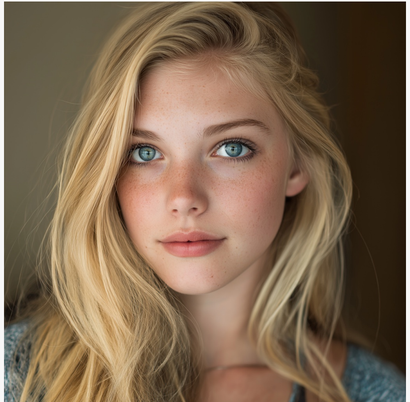
ALMA, the memory