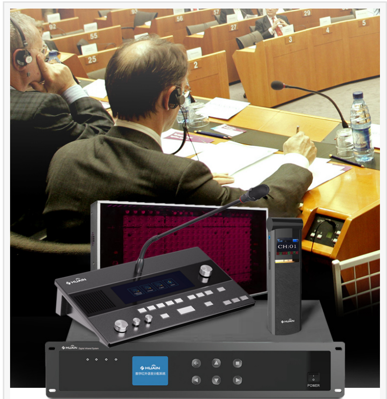
China Top Wired Microphone Factory - HUAYIN

A truly world-class interpreter system must meet several demanding criteria. Beyond basic audio clarity, it must provide stable signal transmission, support for multiple channels, and secure encryption to ensure confidentiality. At international events, interpreters need instantaneous, interference-free communication that doesn't falter under heavy data traffic. Modern interpretation systems should also integrate with a wider conference ecosystem, including wired and wireless microphones, voting units, digital discussion systems, and remote conferencing platforms. This is where HUAIN's solutions excel. They blend cutting-edge digital infrared and wireless communication technologies with intelligent control interfaces, offering a holistic platform rather than just a stand-alone device.