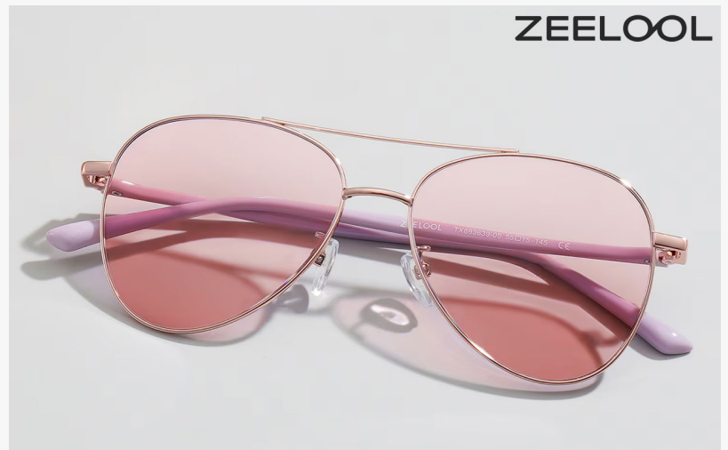
ZEELOOL aviator glasses frames