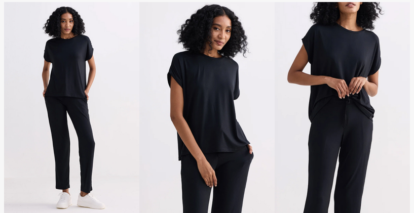
Relaxed Tee Set In Black