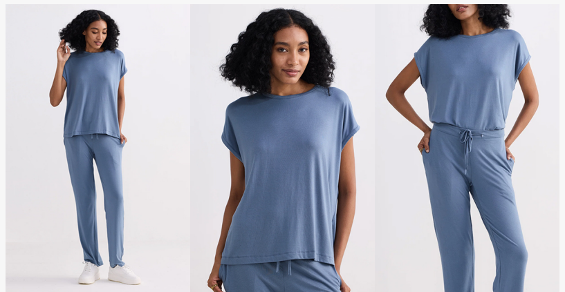
Relaxed Tee Set In Blue