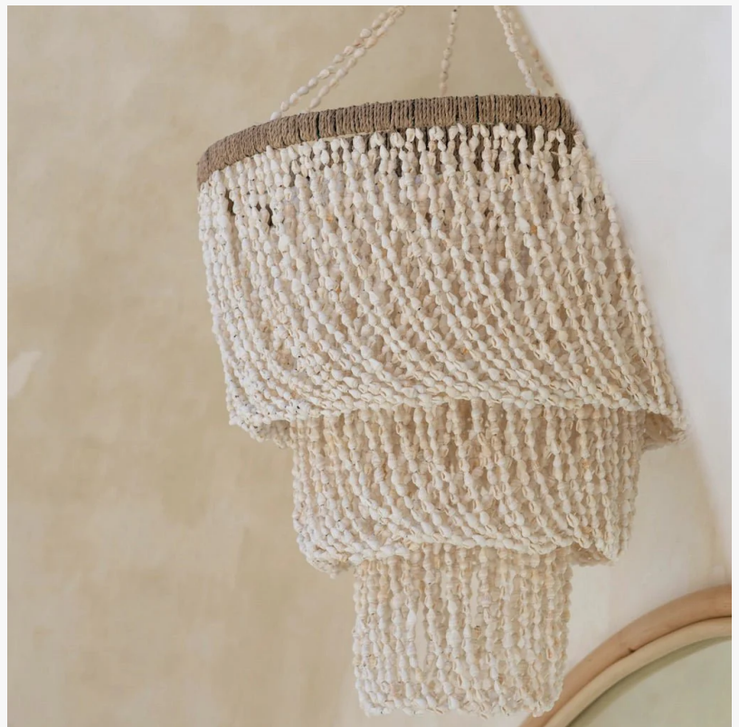
Hanging pendant lights with glass and metal shades