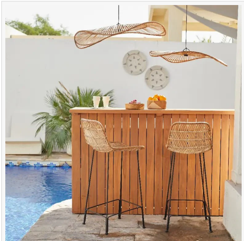
Hanging pendant lights above dining table in modern interior

Rustic and farmhouse-inspired designs use natural materials such as wood or woven fibers. They