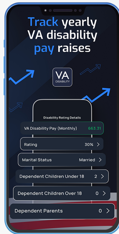
Track Yearly VA disability pay raises

Unlike legacy calculator apps that have remained largely unchanged for years, VA Disability Rates Calculator was designed around how veterans actually need to use these tools — with features like one-tap trending calculations for common scenarios (90% Single, 100% Married) and real-time updates when COLA adjustments hit.