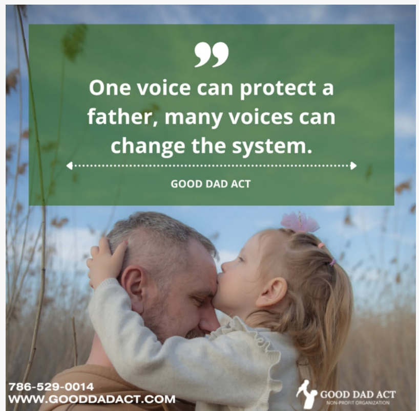
One Dads Voice Changes the System