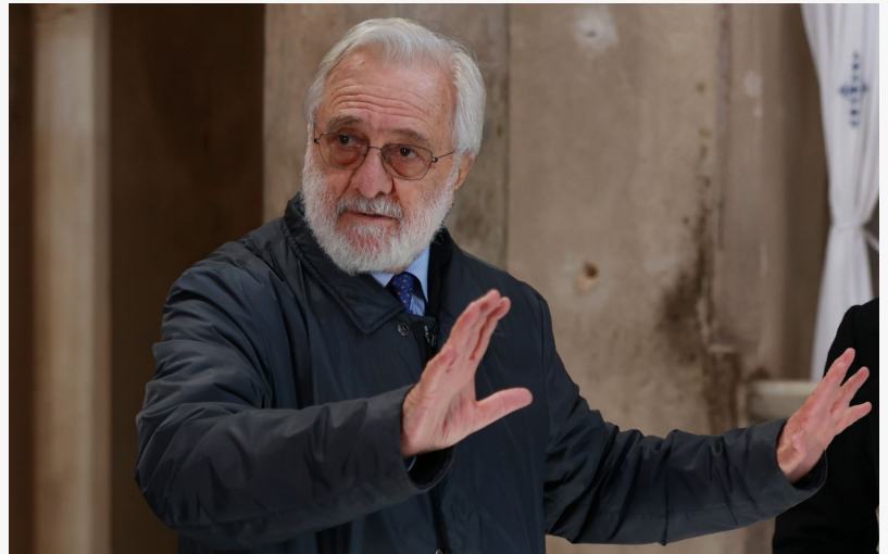
Acclaimed Filmmaker & Director Yannis Smaragdis

and introduced one of the world’s first AI Film Award categories, the 2026 edition will expand its artistic programming, masterclasses, cultural experiences, and global collaborations.