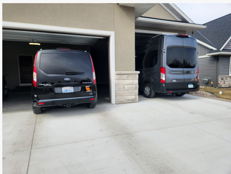
A compact Class B campervan parked inside a standard residential garage, reflecting the growing demand for RV-compatible living in HOA communities.

Smaller, garageable RVs integrate more naturally into these environments. Designed to be stored indoors, compact campervans allow homeowners to retain RV ownership without relying on paid storage facilities or conflicting with neighborhood parking rules. This compatibility has made small and micro RV formats especially appealing to homeowners who want to balance community living with travel freedom.