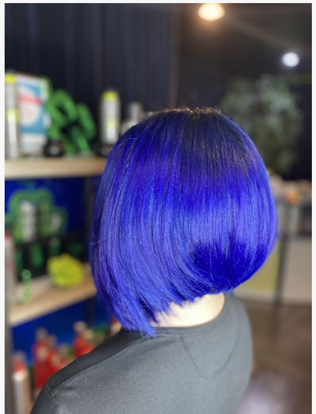
Hair Colour Services in Raleigh

Maintaining hair health during and after colouring is essential. Professional hair colour products differ from retail products in both formulation and application. High-quality products contain protective ingredients that reduce damage from chemical processes. Proper application techniques are also critical, as they minimize hair breakage and ensure even colour