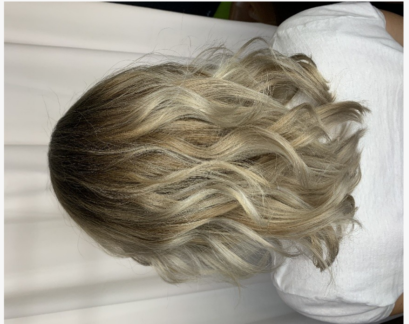
Trained Hair Stylists-