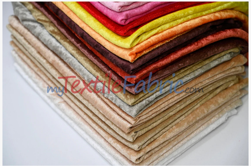
Panne Velvet Fabric