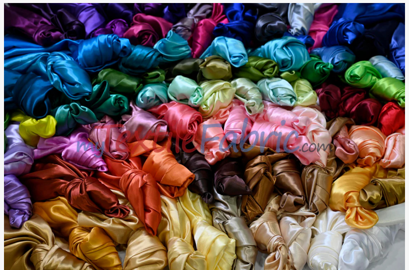
Charmeuse Satin Fabric _