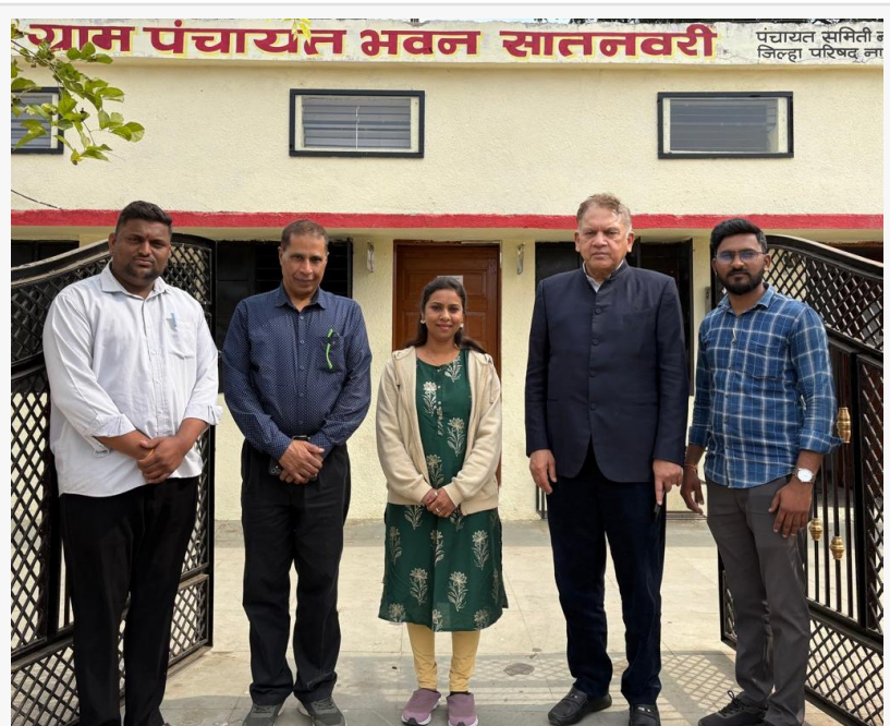
Edufront team at Satnavari

Edufront Technologies is committed to revolutionizing school education through AI-driven platforms, interactive content, and holistic digital ecosystems. By addressing administrative and pedagogical challenges, Edufront enables personalized learning and equips students to compete globally. Edufront is supported by The Jha Group, Beaconsfield Capital, Roby Limited and Jha Capital Management. Visit www.edufont.co.in for more details.