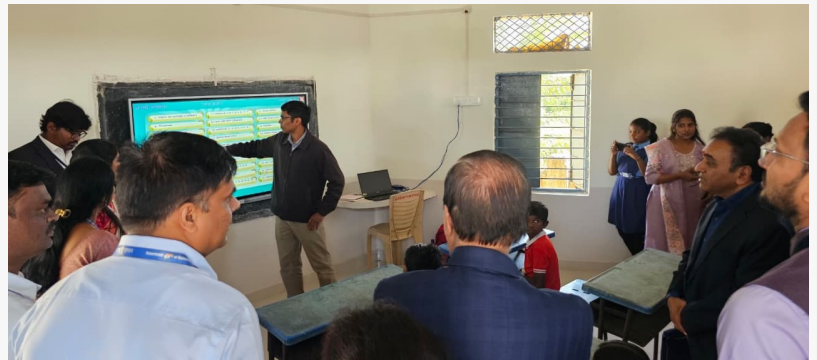
Edufront team's demo to Maharashtra Chief Secretary at Satnavari