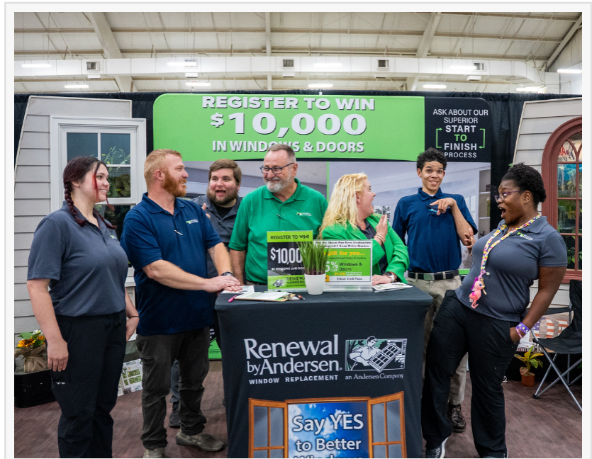
Vendors posing at a local home show, hosted by Nationwide Expos.

Exclusive discounts, promotions, and financing options available only at the show