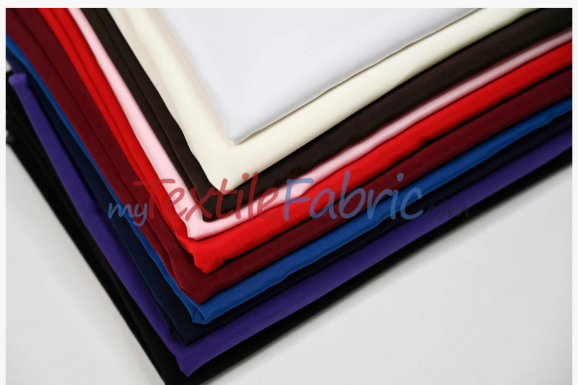
Peachskin Fabric -

The updated shade range spans several commonly used fabric types, supporting a wide variety