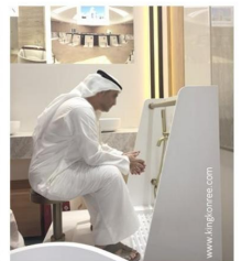
Best Wudu Wash Station for Hygienic and Efficient Ablution