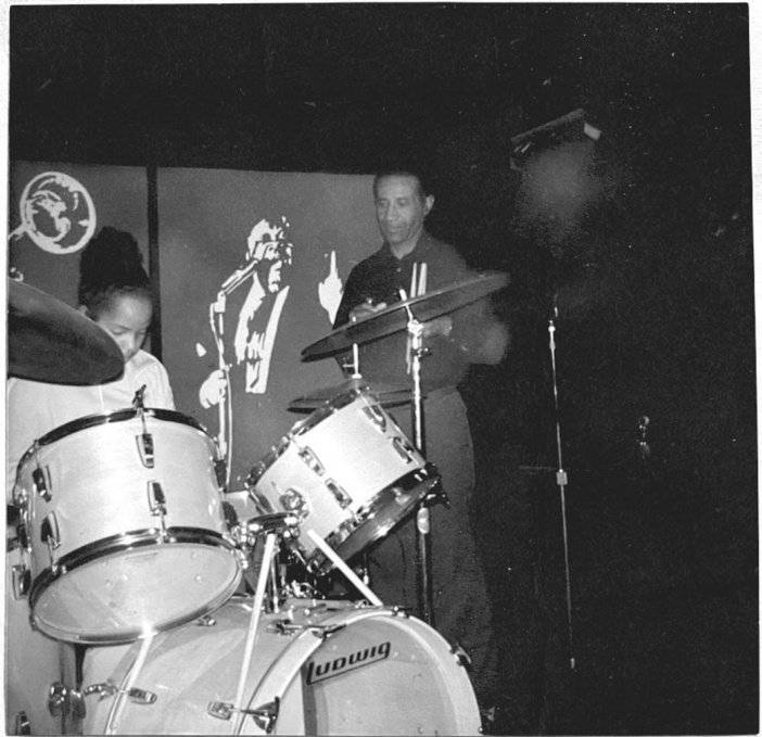
Young Terri Lyne Carrington with Jazz Icon Max Roach

"Max Roach has always been an important person and influence in my life," says Carrington, who started her professional career at ten years old.