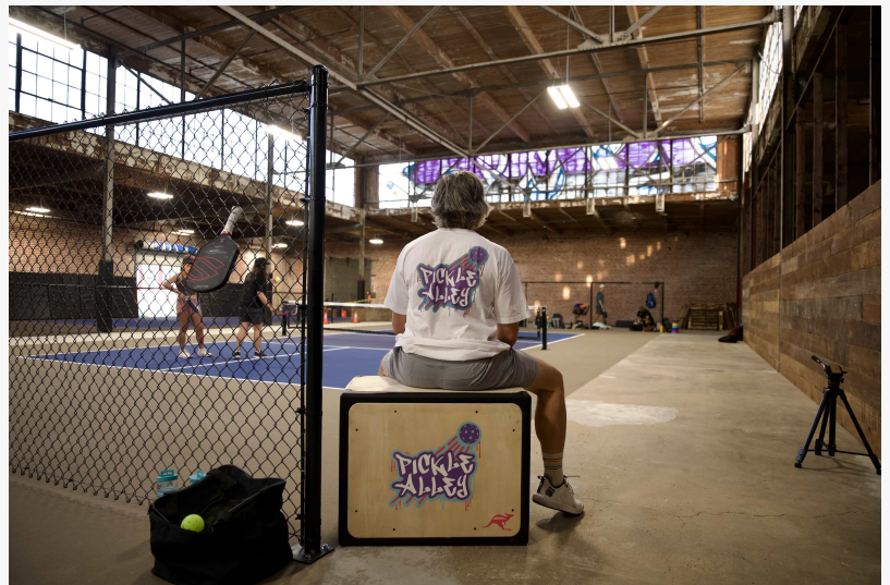
Pickle Alley - Let's Play