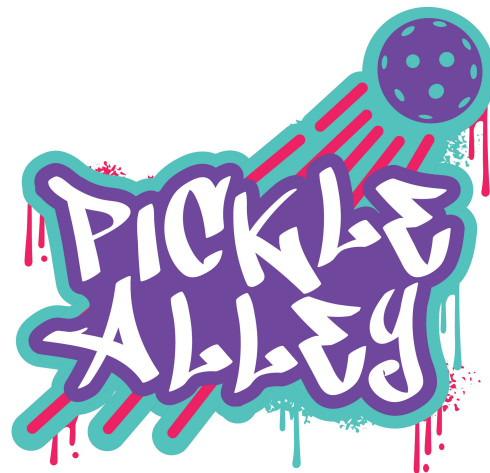
Pickle Alley LA - Logo

EINPresswire.com/ -- Downtown Los Angeles welcomes a bold new chapter in its cultural and recreational renaissance with the soft opening of Pickle Alley LA, a locally owned indoor-outdoor pickleball LA and fitness club redefining how Angelenos play, train, and connect.