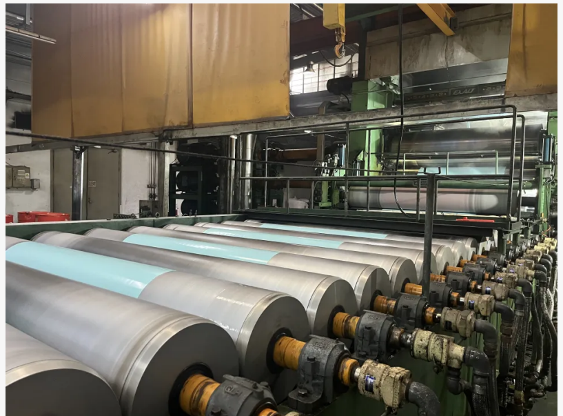
China Best Cover Tarpaulin Factory - Linyang