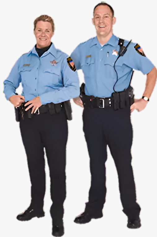
armed security guard