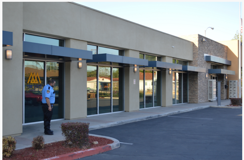
Shopping Center Security Guards-