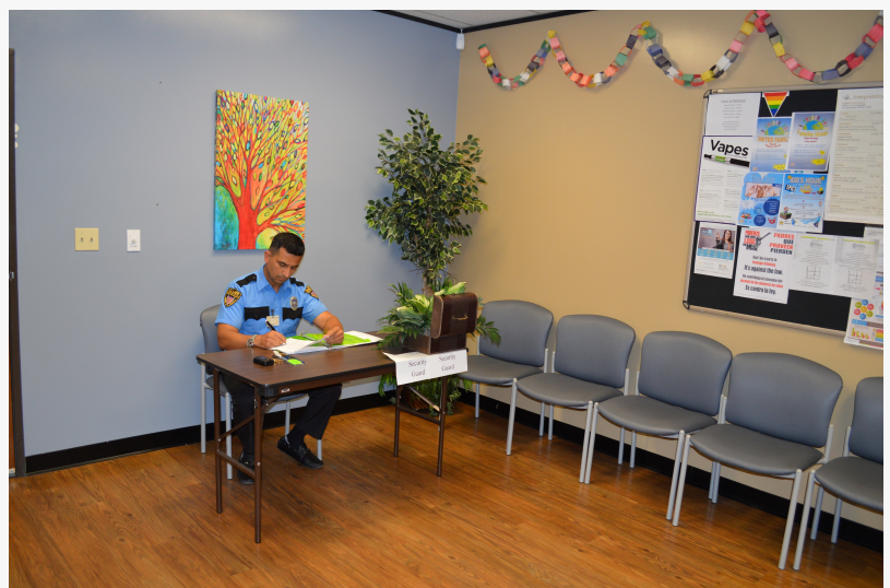
Security Guard Service.