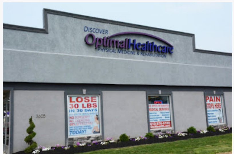
Discover Optimal Healthcare leading spine and pain specialists