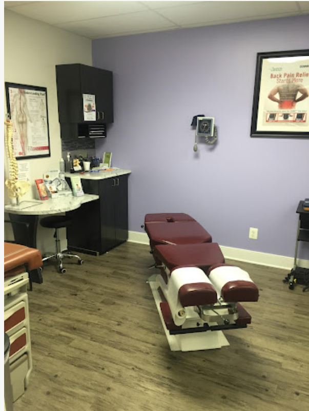
Knee Pain Treatment

A back pain treatment Brookhaven usually involves posture training, gentle movement, and muscle strength work in the care plan. Knee pain treatment commonly includes drills for balance, joint support, and training for walking control. Patients who adhered to treatment for at least eight weeks exhibited gradual improvement and fewer return visits.