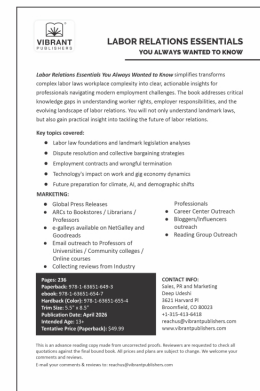
GALLEY BACK COVER

Galley cover of Labor Relations Essentials You Always Wanted to Know by Vibrant Publishers