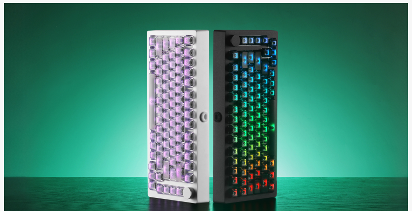
M1 V5 TMR supports MagMech and compatible with both Mechanical and Magnetic Switches Keyboard