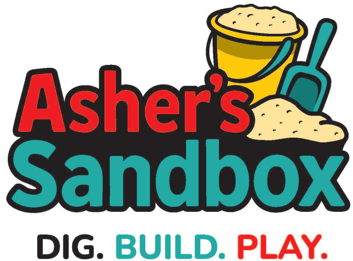
Asher's Sandbox logo