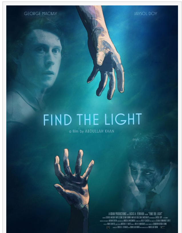
FIND THE LIGHT POSTER