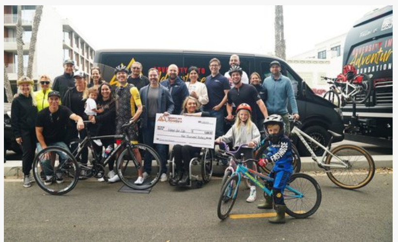
Adversity Into Adventure presents check to neurological research foundation, Wings For Life Foundation

This press release can be viewed online at: https://www.einpresswire.com/article/879545653