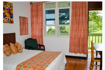
Locally owned beachfront accommodations in Portsmouth, Dominica, used as the base for One With Whales expeditions