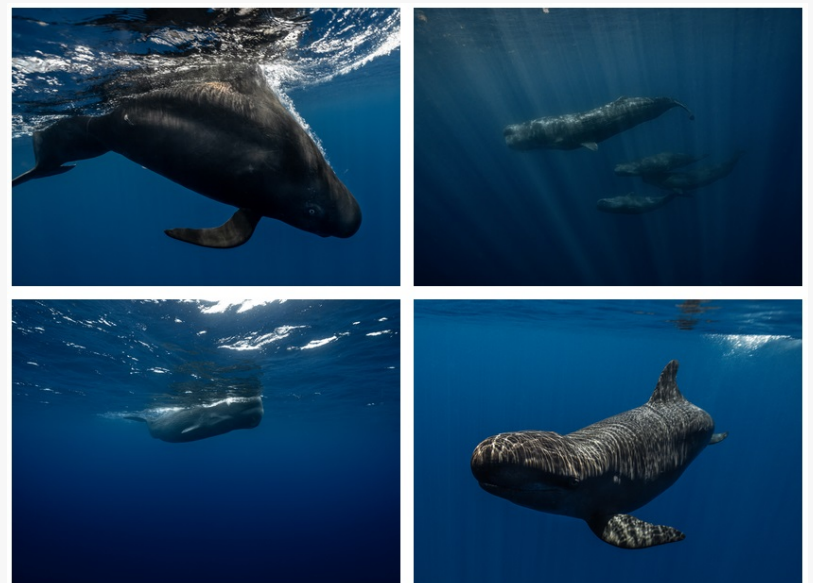
Sperm whales resting and socializing near the surface in Dominica's coastal waters