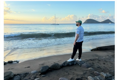
Land day activities offering a deeper connection to Dominica beyond time spent at sea

This structure distinguishes the program from many whale watching tours in Dominica and aligns it more closely with conservation-based research practices.