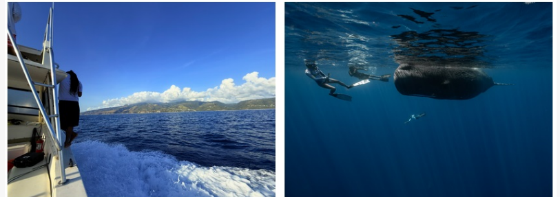
Small-group, whale-led in-water encounters supported by a licensed crew during One With Whales expeditions in Dominica