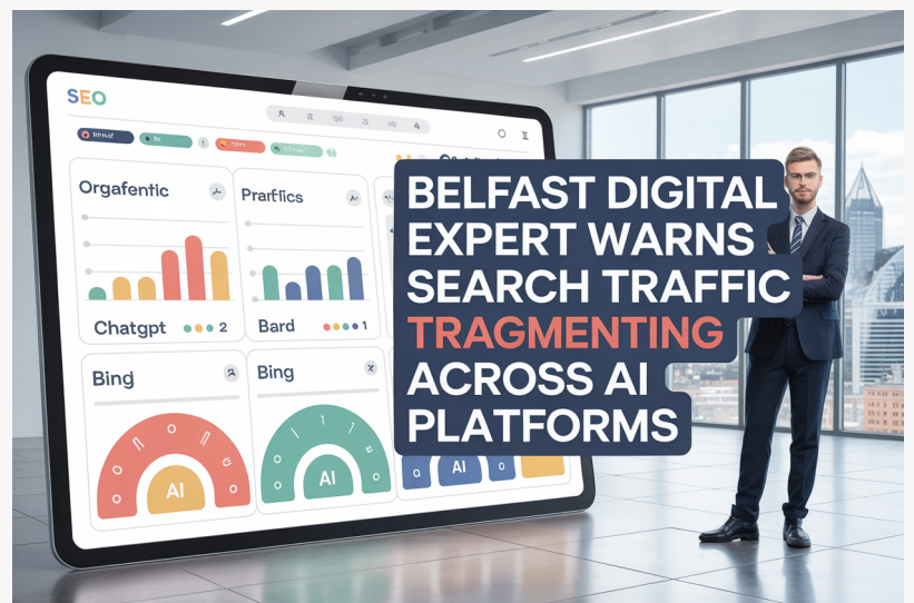
The search landscape has fragmented across AI platforms. Businesses preparing now will thrive.