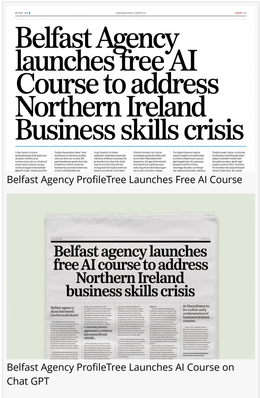
Belfast Agency ProfileTree Launches Free AI Course

Finally, the programme addresses strategic AI planning, helping businesses develop roadmaps for ongoing AI adoption that align with their specific goals, resources, and risk tolerance. Participants complete the course with a personalised AI implementation plan they can begin executing immediately.