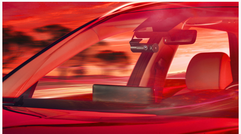
ELITE 10 Car Sunset