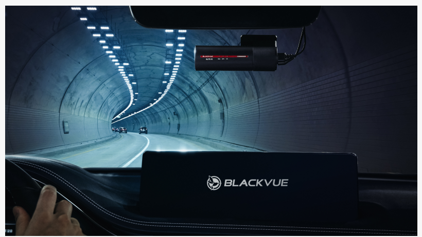
ELITE 10 In-Car Tunnel View

- Seamless Connectivity: Fully BlackVue Cloud-compatible, the ELITE 10 ensures anytime access via Wi-Fi hotspot or the optional BlackVue LTE Connectivity Module.