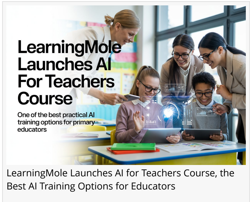
LearningMole Launches AI for Teachers Course, the Best AI Training Options for Educators

BELFAST, COUNTY ANTRIM, UNITED KINGDOM, January 19, 2026 /EINPresswire.com/ -- LearningMole Launches AI Literacy Initiative to Help Teachers and Parents Prepare Children for an AI-Enabled World Educational platform announces expanded course programme addressing critical thinking, responsible use, and AI understanding for educators and families