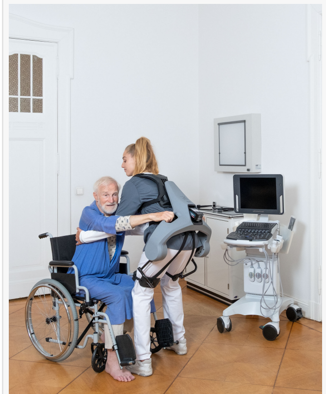
German Bionic Exia exoskeleton for use in nursing and other care environments