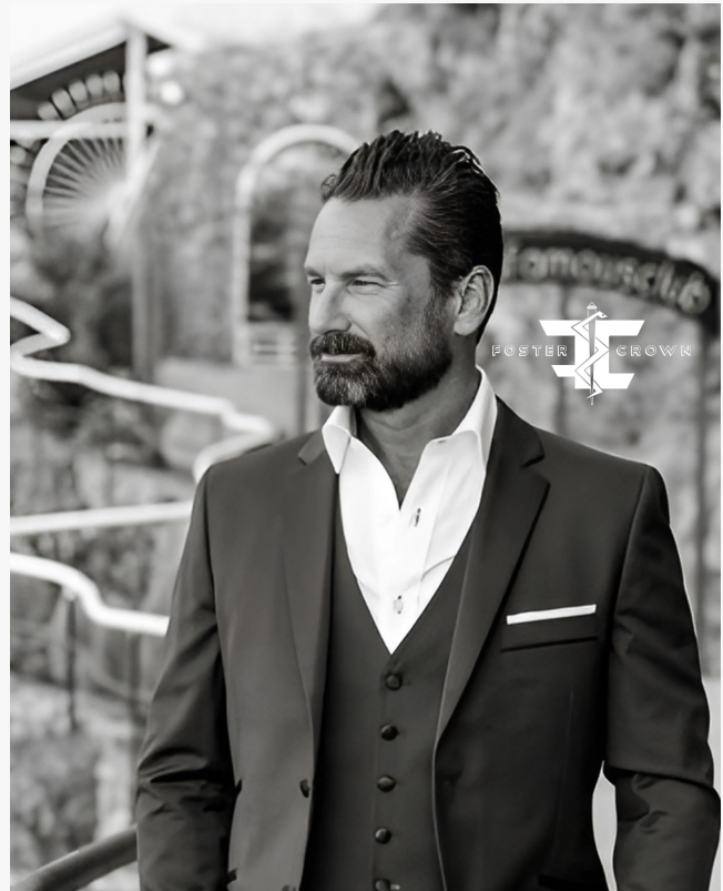
Foster Crown's CEO