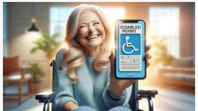
disability parking permit online