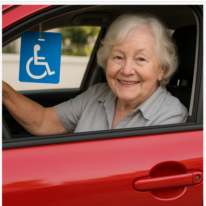
new york disabled parking permit medical certification assistance

Buffalo-specific support pathway. Buffalo residents frequently search for local guidance on how