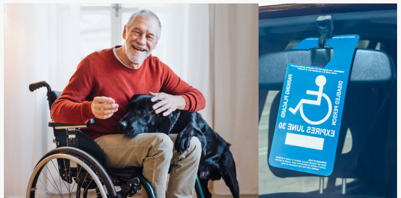
get disabled permit online