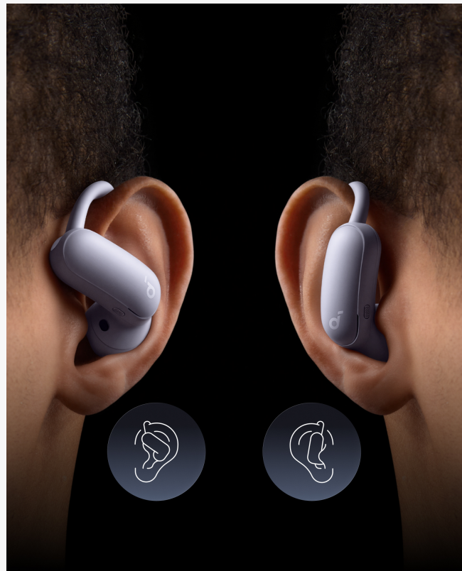
AeroFit 2 Pro Showing Different Modes