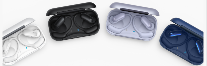
Soundcore's New AeroFit 2 Pro - Hybrid Earbuds with Open Ear and Noise Cancelling Modes