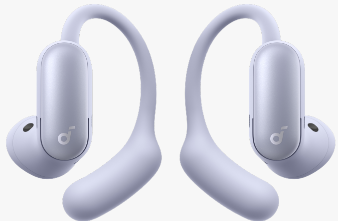
Soundcore's New AeroFit 2 Pro in Purple Offer Both Open Ear and ANC Feature in Single Pair of Earbuds