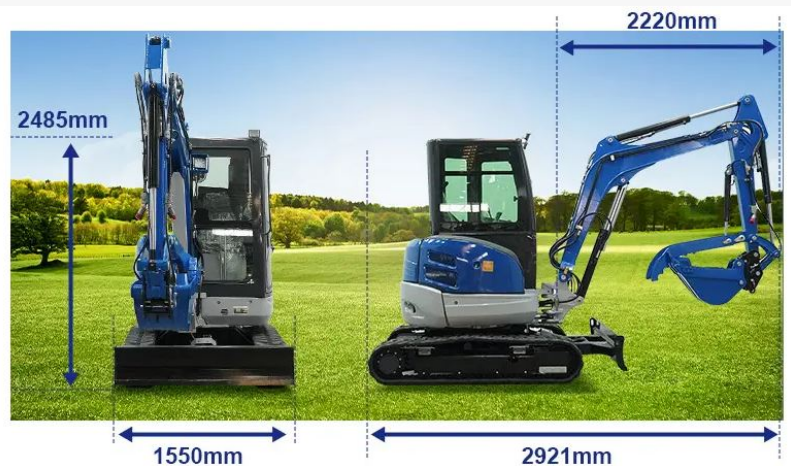
Rippa R32 Dimensions