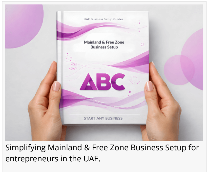
Simplifying Mainland & Free Zone Business Setup for entrepreneurs in the UAE.

This is where Start Any Business (SAB) comes in to help aspiring entrepreneurs. We are here to make the whole business setup journey easier. Our UAE Business Setup Guides , which are well-structured, assist individuals and corporations in making confident and informed choices. We have a simple goal: to make business setup in the UAE easy, transparent, and free of stress while providing full support at every stage.