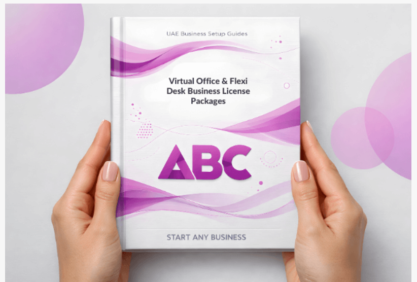
Smart Virtual Office & Flexi Desk Business License Packages for startups.