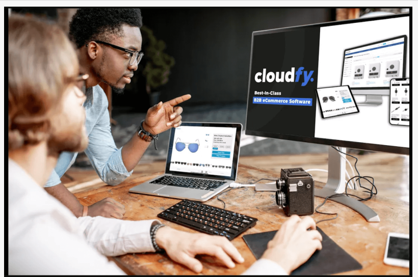
Cloudfy is a global SaaS B2B eCommerce platform