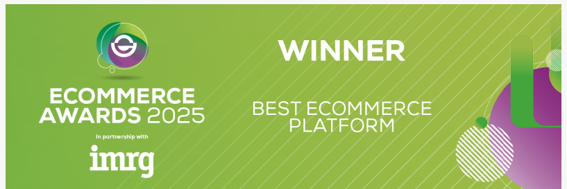
Ecommerce Awards London Winners - Best B2B Ecommerce Platform