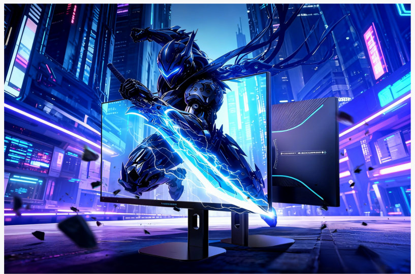
The world's first gaming monitor and gaming laptop integrated with Audfly's Focusound Screen® technology

"Naked-Ear" Immersion with Hybrid Spatial Audio The highlight of the launch is the debut of Audfly's Hybrid Spatial Audio technology on the new Thunderobot monitor.