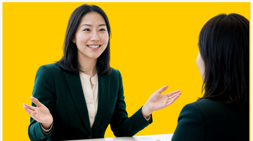
Divorce Service Hong Kong

Recognizing that divorce is one of life's most stressful events, Better Life provides a streamlined, compassionate, and cost-effective alternative to traditional navigation of the legal system.