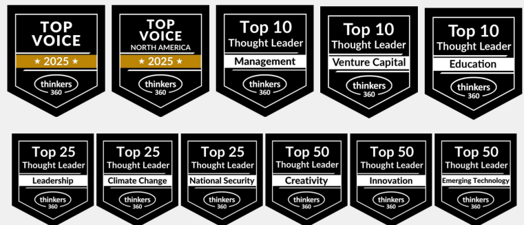
Thinkers360 Names Roger Spitz Top Voice for 2025