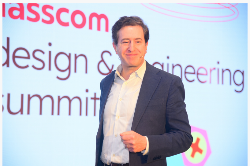
Roger Spitz Keynote Talk - Nasscom 2024 (Bangalore, India)

SAN FRANCISCO, CA, UNITED STATES, January 8, 2026 /EINPresswire.com/ -- Leadership is undergoing its most radical transformation in half a century. As linear strategies collapse under the weight of Metaruptions - systemic, self-reinforcing forces of change - the demand for predictive 'futurism' is evaporating. Global organizations now seek agency to make effective decisions amid deep uncertainty.